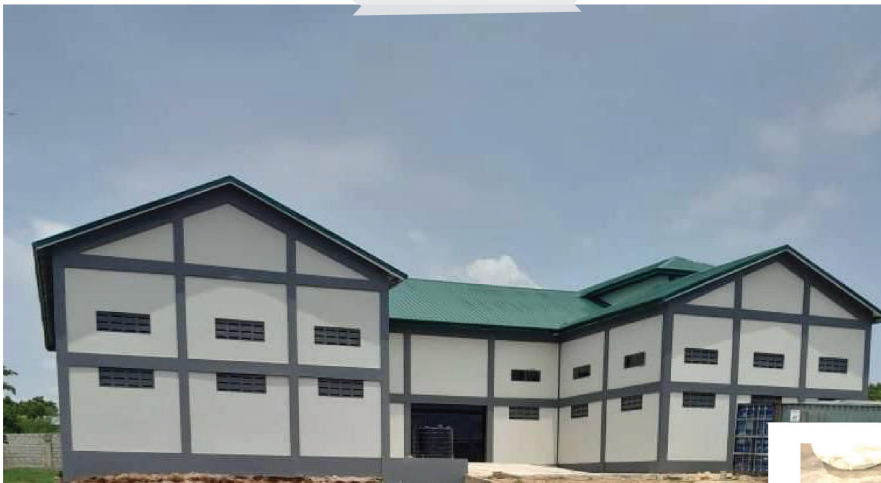
NDEDE Limited Company Factory