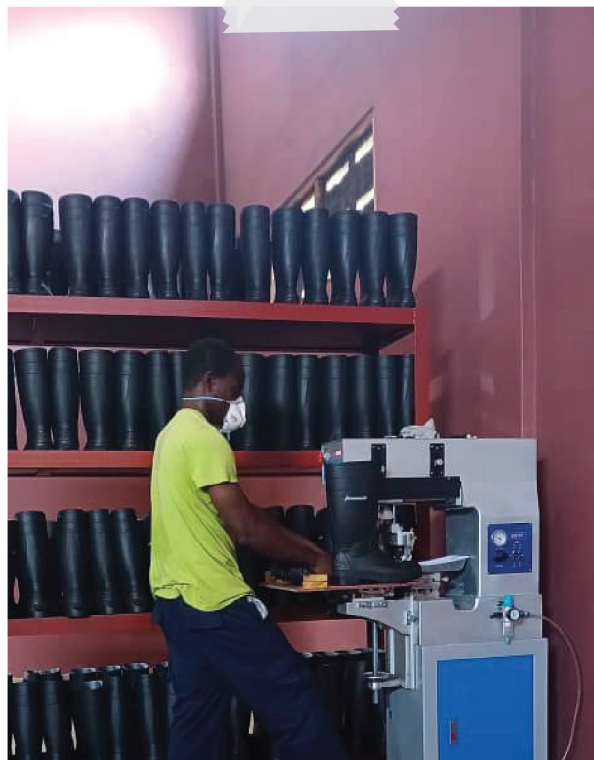
Final inspection and storage of TENACK Boots