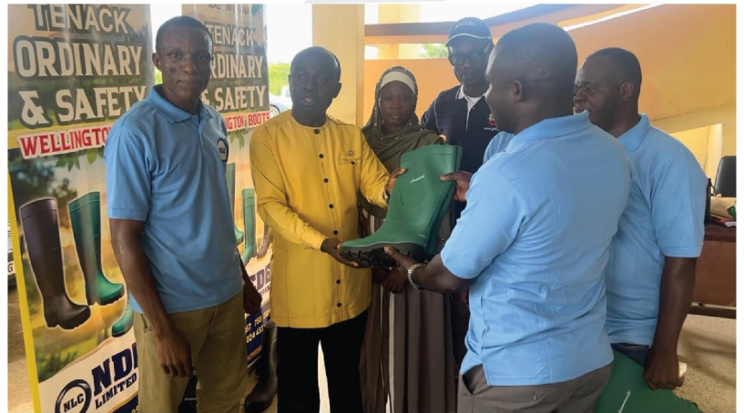
Donation to Gomoa East District Assembly