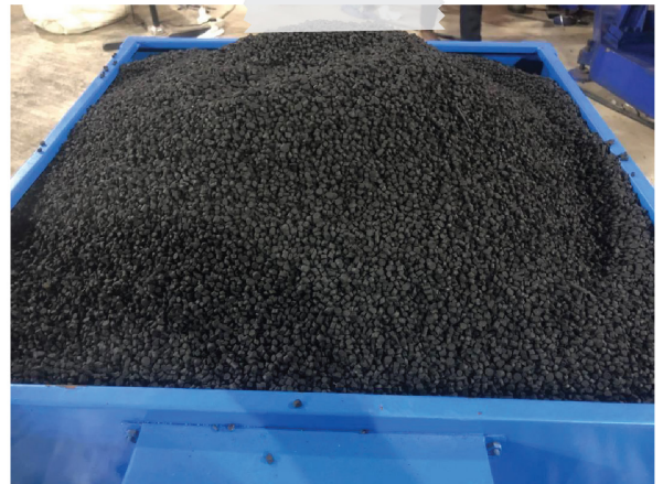
High Quality raw PVC granules