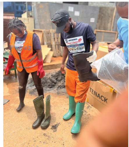
Donation to Buzstopboys