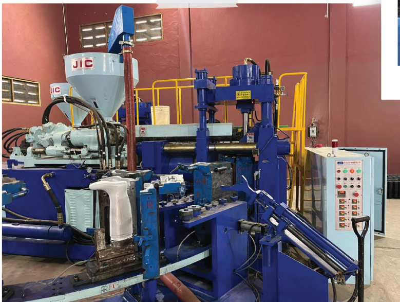
Moulding machine in operation