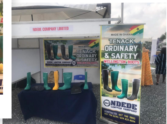
TENACK Boots Exhibition