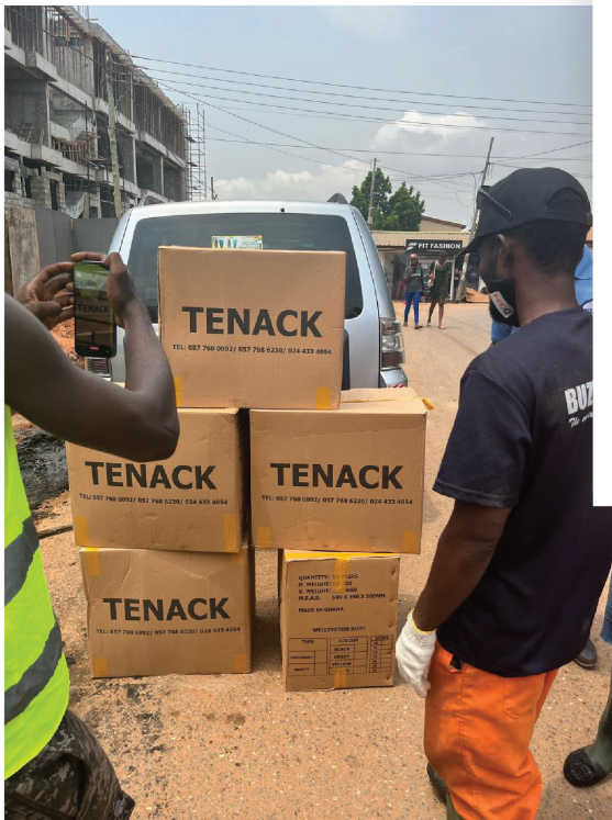
Donation to Buzstopboys