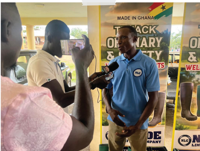
Donation to Gomoa East District Assembly