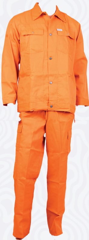
Safety Overall Suit