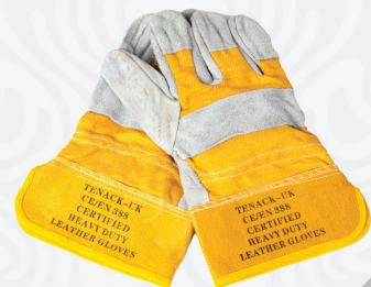
Leather Safety Gloves